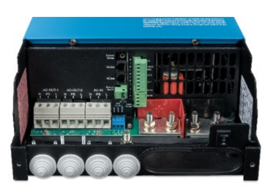
Connection Area 12/3000/120-50